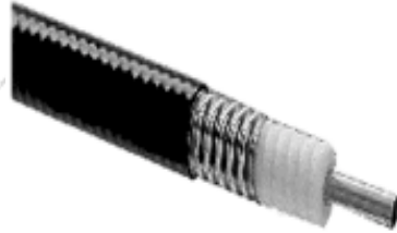
7/8" FOAM DIELECTRIC COAXIAL CABLE